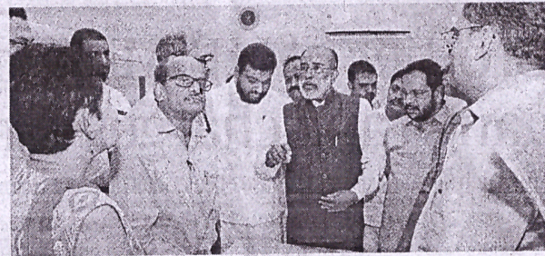
K.J. Alphons, Union Minister of State for Tourism, interacting with railway authorities during his visit to the Kottayam railway station on Tuesday.

Chengannur station to get highest outlay for development